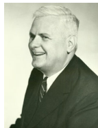
Alonzo Church (1903–1995)