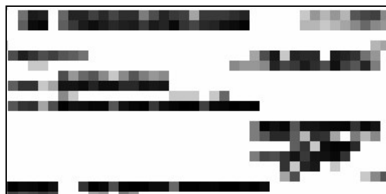
Figure 3. Entropy based image